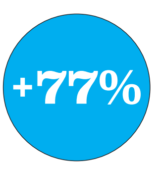
International profit before tax increased to £15.4 million

Vanquis Bank began a market test of Visa branded credit cards in the UK in April 2003 and by the end of last year had built a portfolio of 37,000 cards. The focus for this year is to monitor the development of the card portfolio, in particular credit quality, in order to reach an informed view as to the attractiveness of the business opportunity by the end of the year. The business is progressing as scheduled. Cards in issue at the half-year were 48,000. As expected, the loss before tax for the first half of the year was £4.6 million (June 2003 £3.4 million).